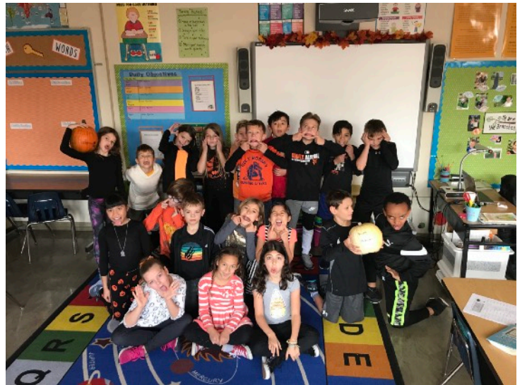
Halloween Reader's Theater and fun class picture:)