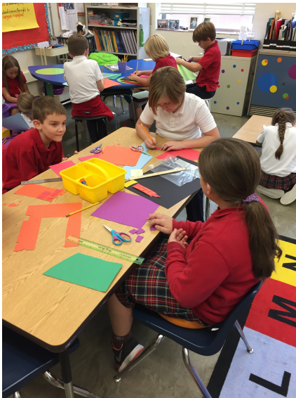
Making array cities